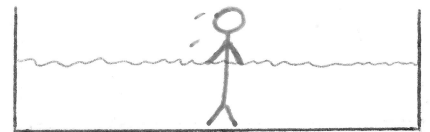
resurrection of Jesus Christ risen to new life in Christ